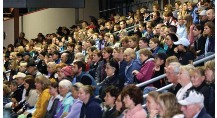
Standing room only

It's great to see how successful we can be when members come together to make something new happen!