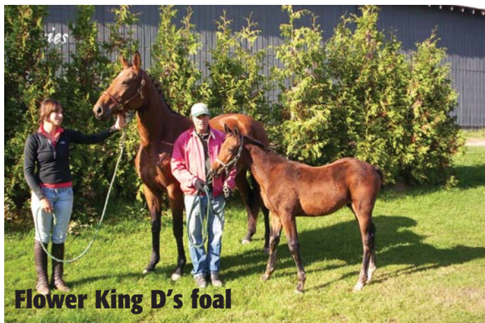
Flower King D's foal

As part of the Annual National Stallion Service Auction (SSA), 50% of the net proceeds from the SSA go to the provinces. From there each allocates 50% to prize money for their Foal Futurity. Look for the auction logo on stallions in the upcoming 2008 Stallion Directory!